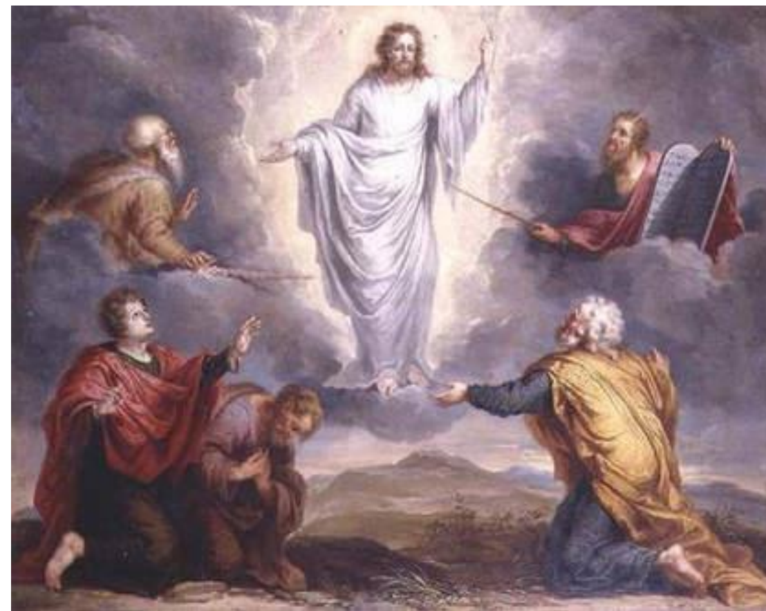
"This is My Son, the Beloved - Listen to Him!"

Luke's Gospel account tells us that while Jesus was transfigured, Peter, James, and John were asleep (Luke 9:32)! Upon awakening they discovered Jesus in glory along with Moses and Elijah. How much do we miss of God's glory and action because we are asleep spiritually? There are many things which can keep our minds asleep to the things of God: Mental lethargy and the "unexamined life" can keep us from thinking things through and facing our doubts and questions. The life of ease can also hinder us from considering the challenging or disturbing demands of Christ. Prejudice can make us blind to something new the Lord may have for us. Even sorrow can be a block until we can see past it to the glory of God.