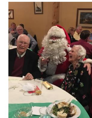
Knights of Columbus Christmas Party