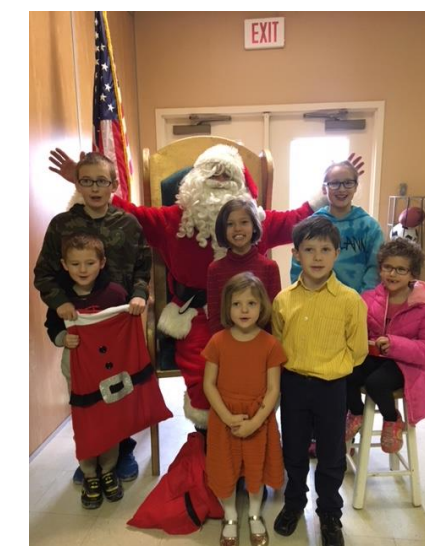
Ho Ho Ho! Merry Christmas to our Blessed Children!