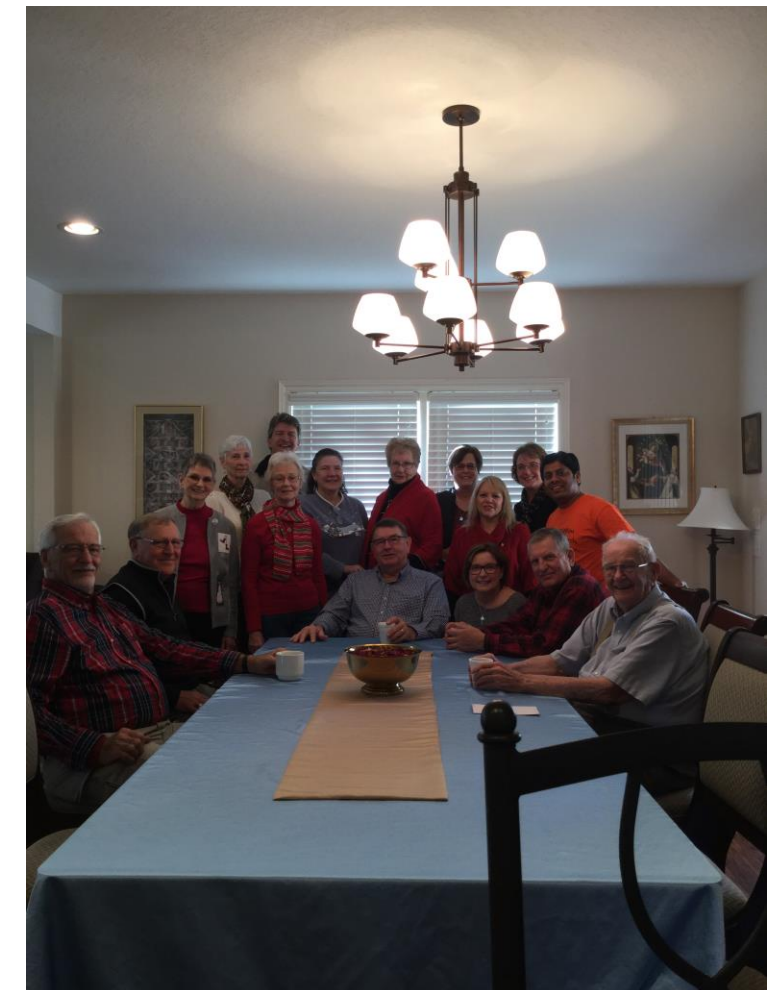
Sharing Christmas Joy and fellowship with our Methodist friends!