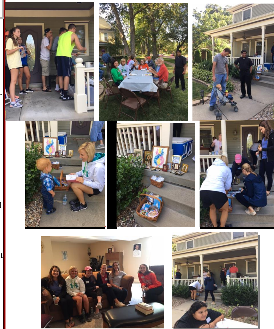
We were so happy and blessed to see around 28 Baker students join us at our Back to School picnic at the Baker Campus Center. The students had food, were given a Campus Center tour, got a chance to chat with parishioners, and take home some beautiful donated religious goods. A GREAT group of young kids! WELCOME!