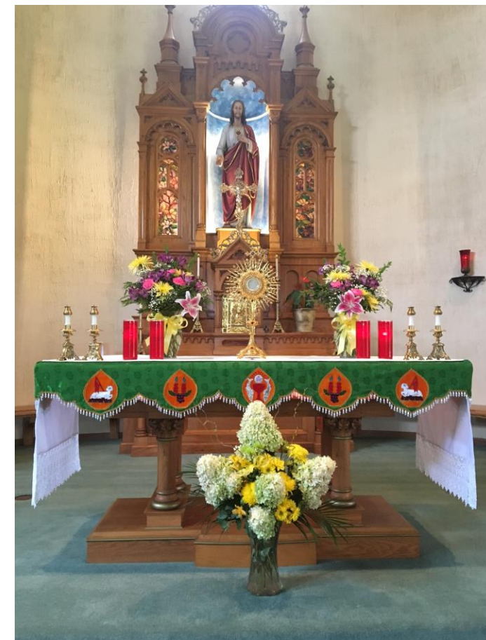
A beautiful Eucharistic Adoration!

"Lord Jesus, help me to trust you always and to never doubt your presence and your power to help me. In my moments of doubt and weakness, may I cling to you as Peter did. Strengthen my faith that I may walk straight in the path you set before me, neither veering to the left nor to the right!"