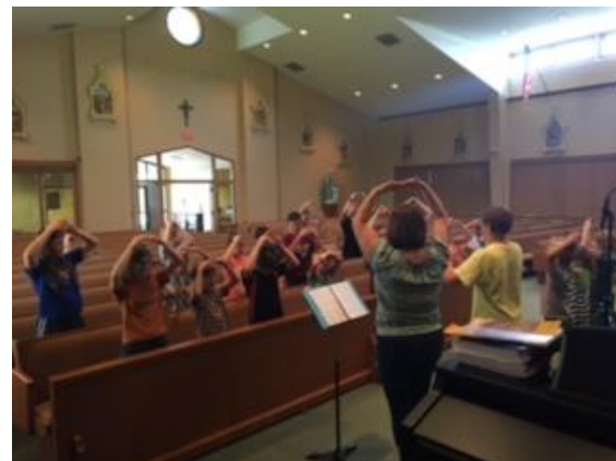
"Hear our praises sing!"