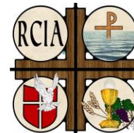
Rite of Christian Initiation for Adults