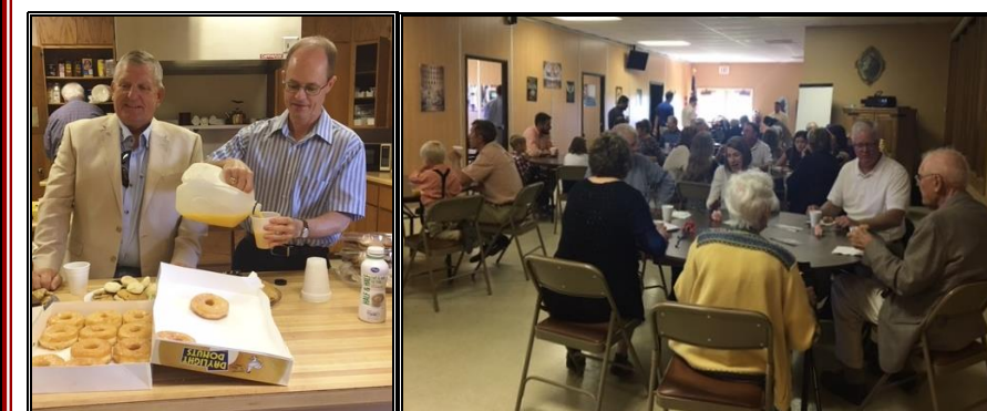
Knights of Columbus men serving mothers at Annunciation with flowers and treats!

"So now faith, hope, and love abide, these three; but the greatest of these is love." 1 Corinthians 13:13