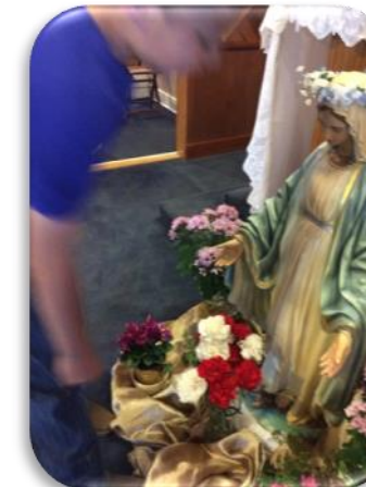
"On this day oh beautiful mother....."