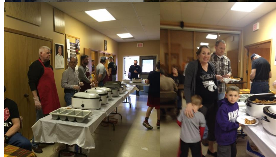
The First Lenten Fish Fry of 2017! Good food and fellowship, see you at the next one on March 24!